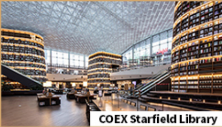
COEX Starfield Library